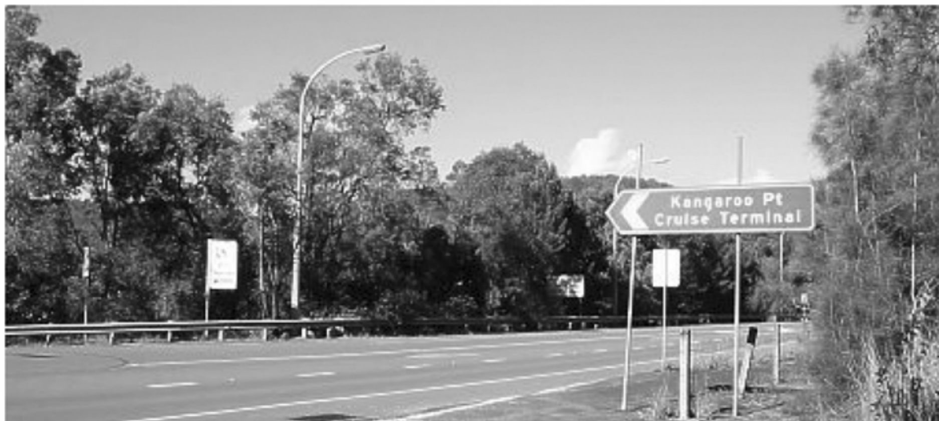
Turn into Kangaroo Point, Brooklyn off the Old Pacific Highway